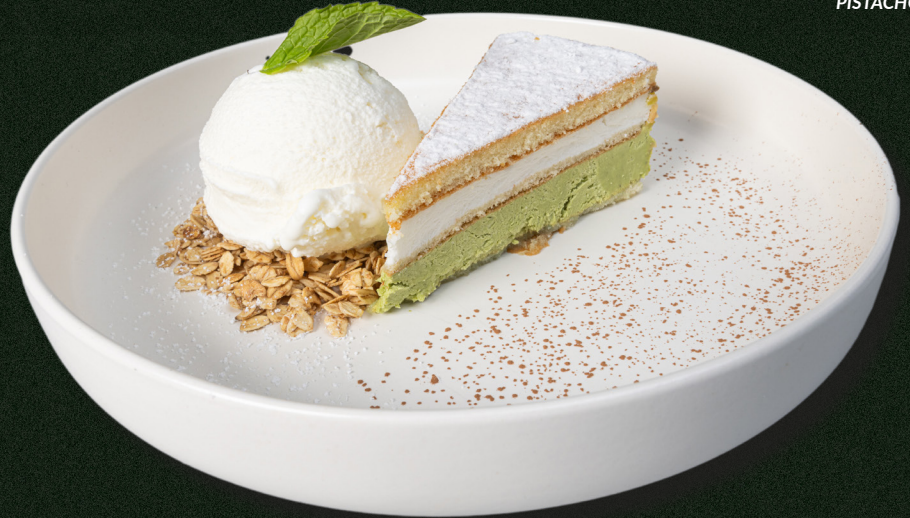
| RICOTA & PISTACHO