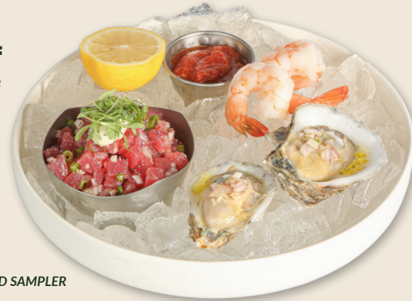
| SEAFOOD SAMPLER

Tuna Tartar, Mignonette Oysters, Shrimps with Cocktail Sauce