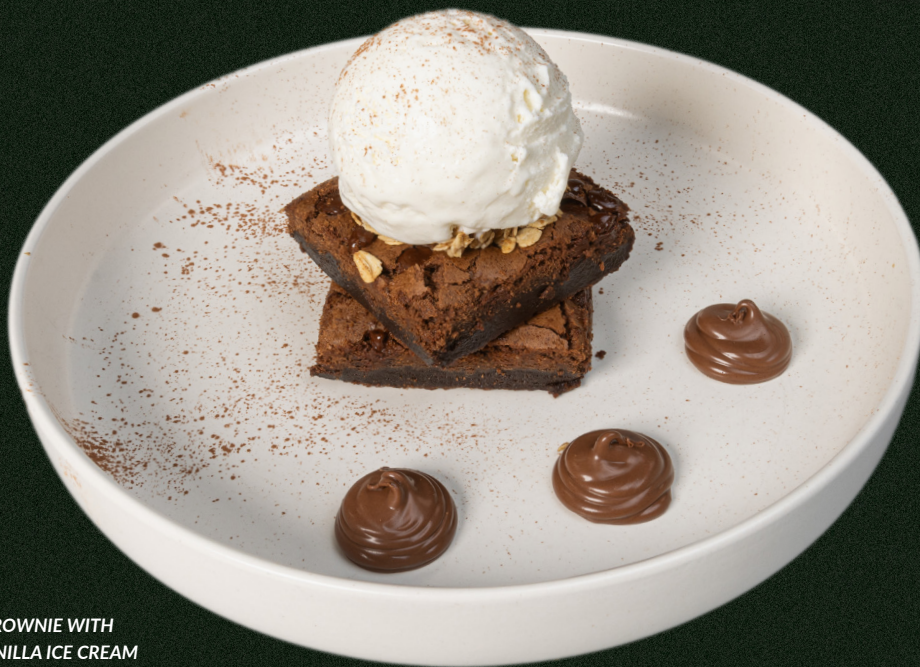
| BROWNIE WITH VANILLA ICE CREAM