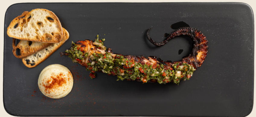
| GRILLED OCTOPUS

2 Beef Empanadas accompanied by Chimichurri and Garlic Aioli