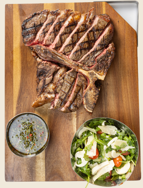
| PORTERHOUSE STEAK 42 oz